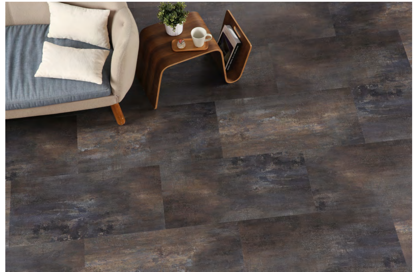
TVS 807 - Intergalactic