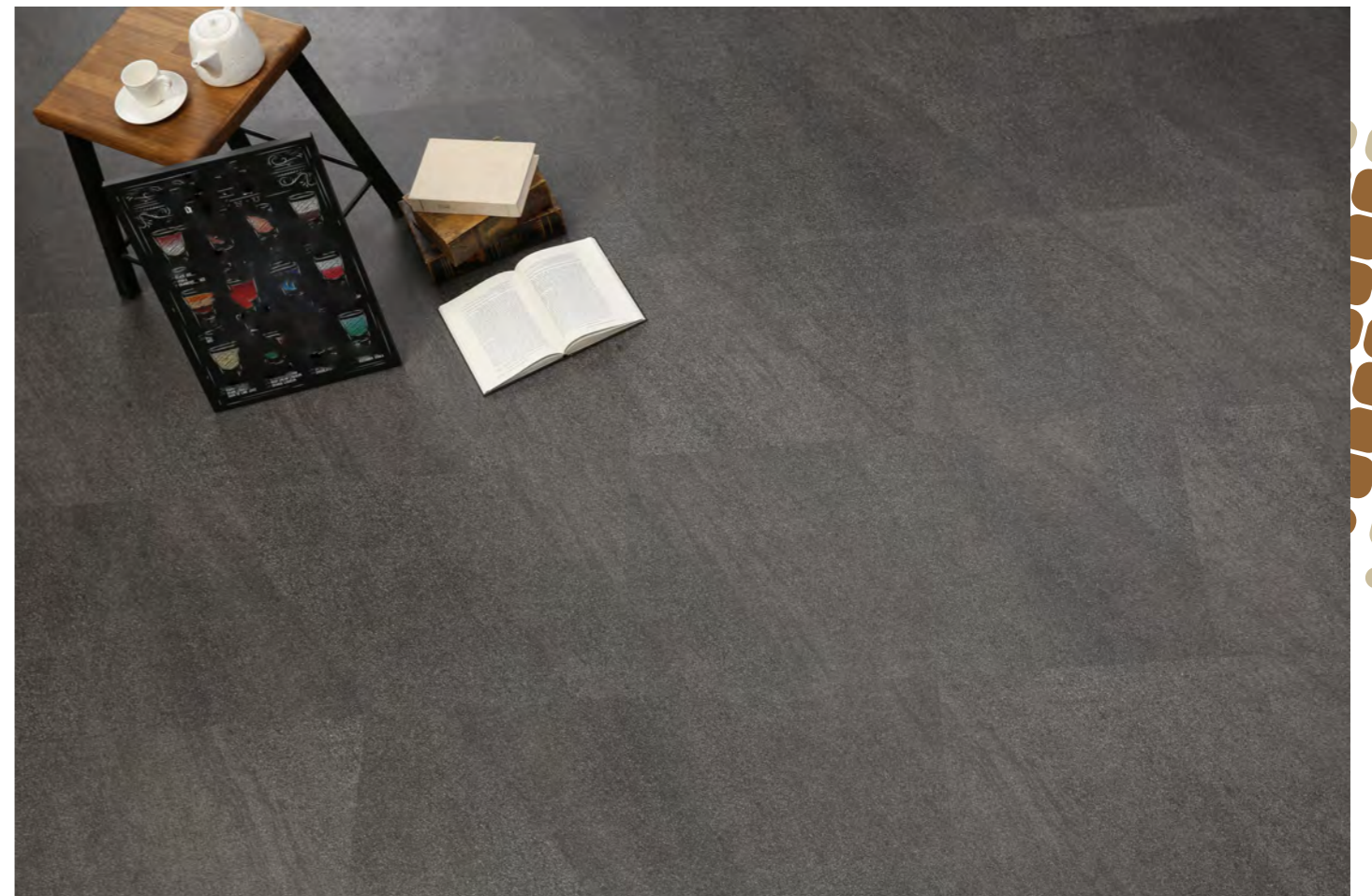
TVS 813 - Incline Black