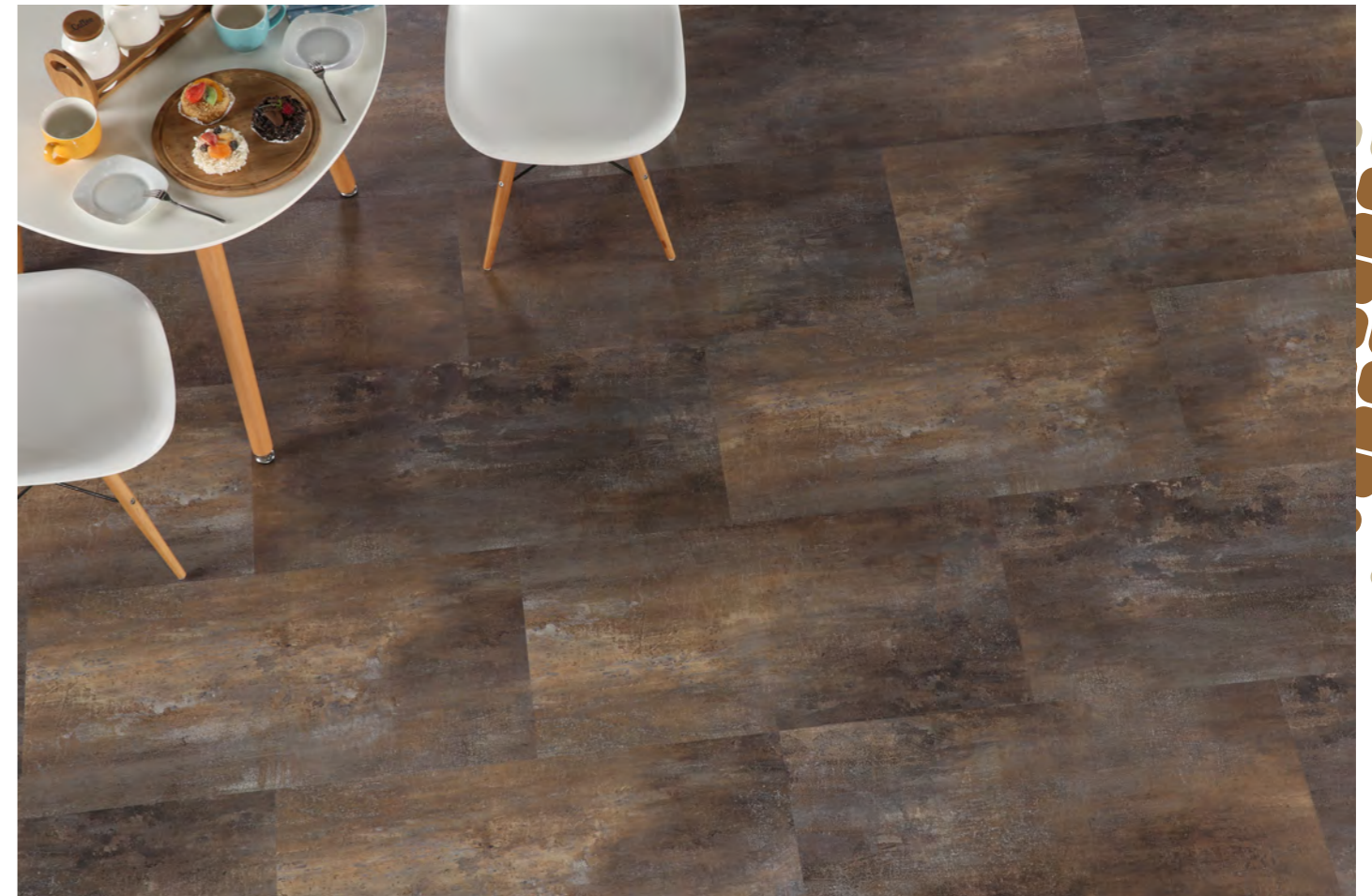
TVS 801 - Earth