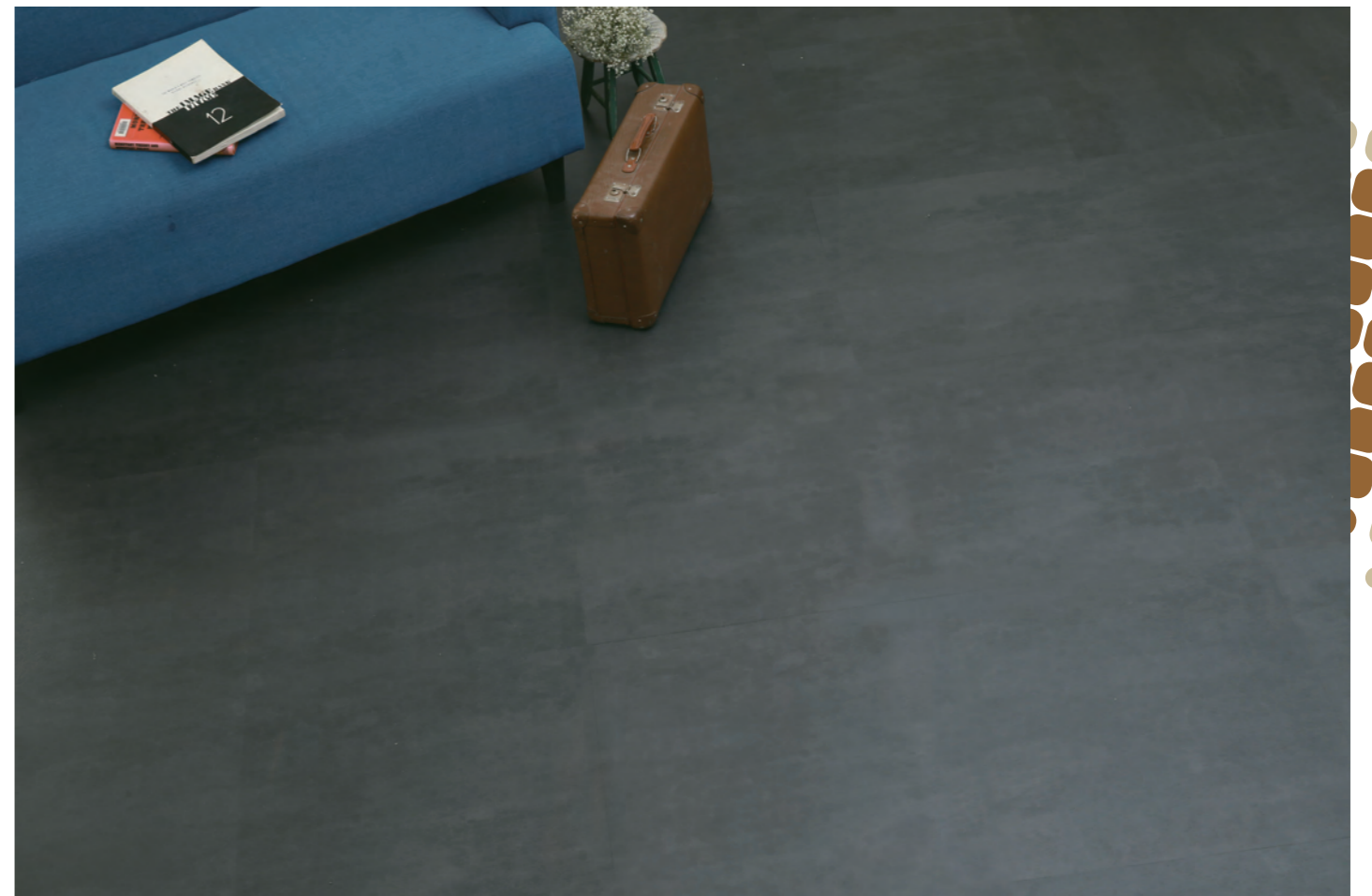
TVS 810 - Charcoal Smooth