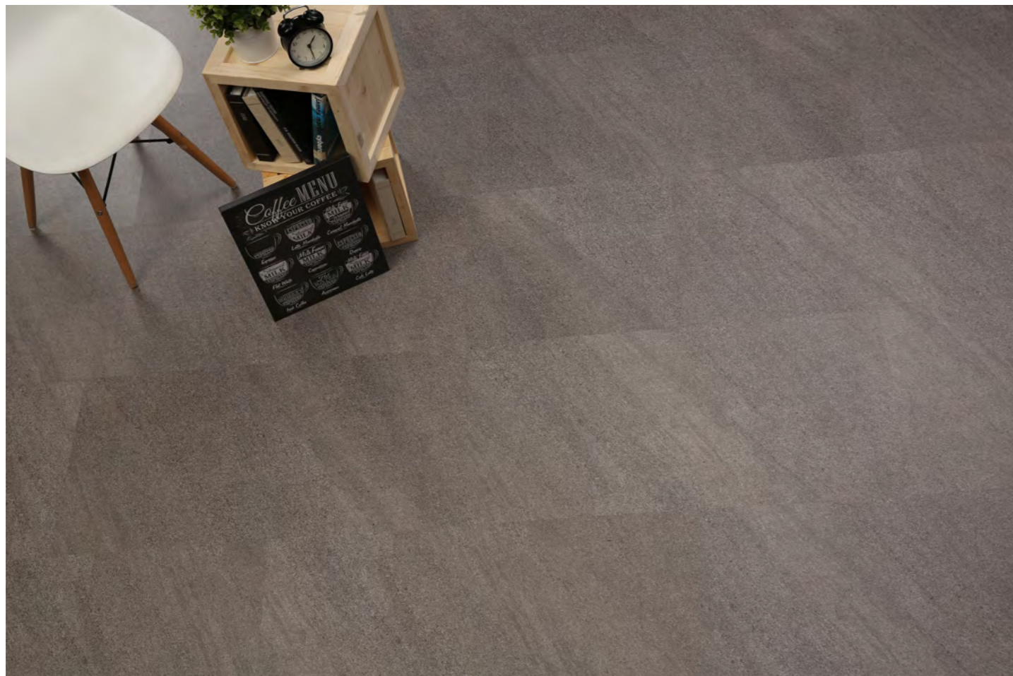
TVS 811 - Slanted Brown