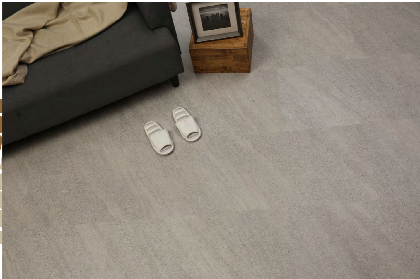
TVS 812 - Diagonal Gray