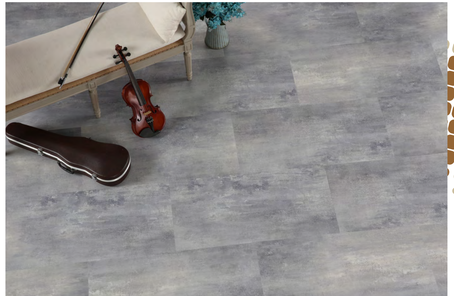
TVS 802 - Ice