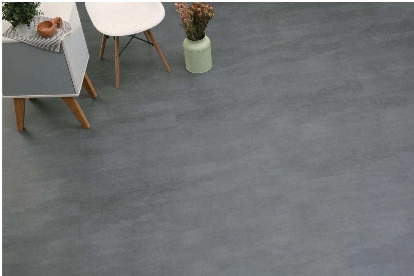
TVS 808 - Graphite Smooth