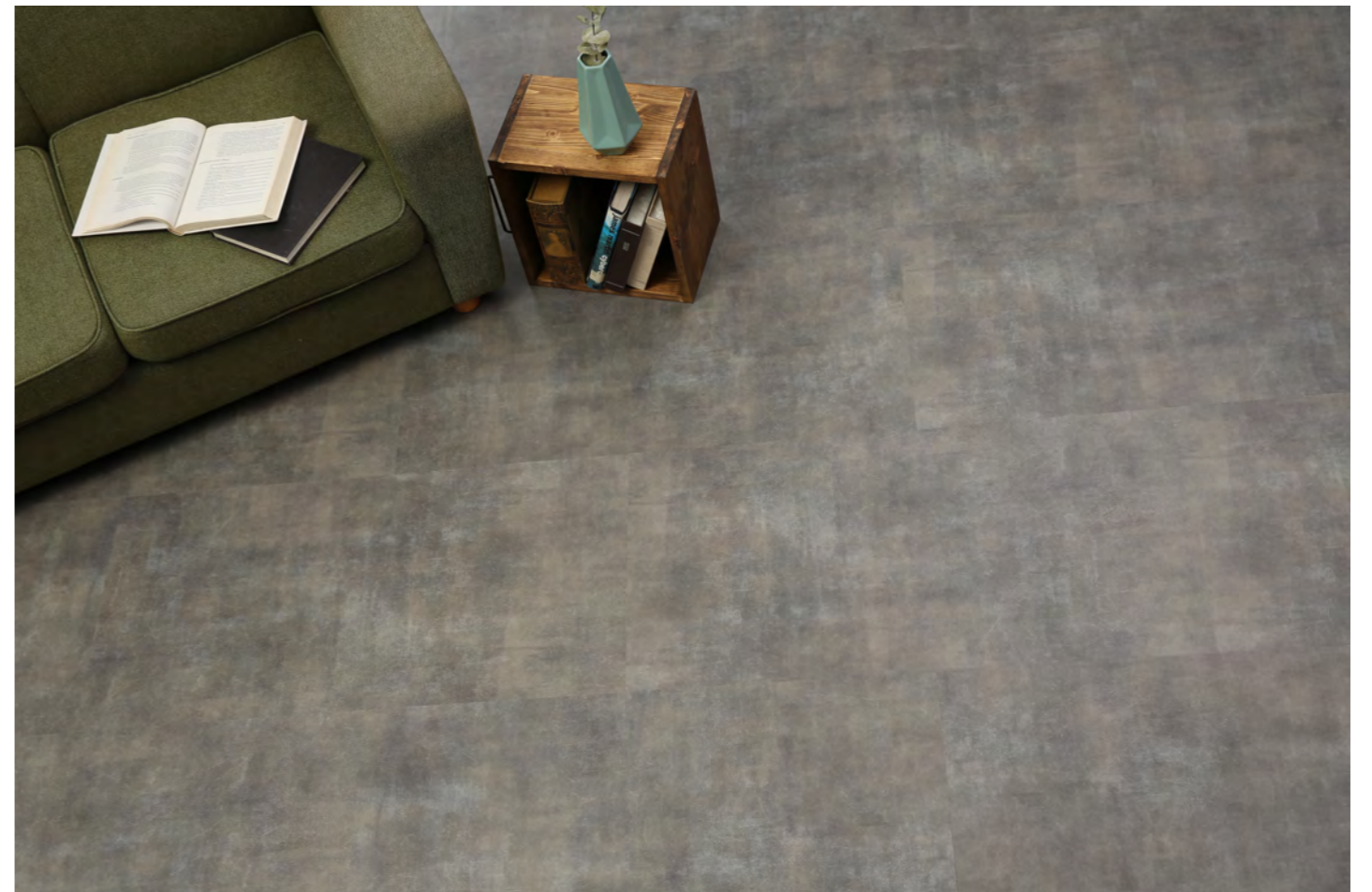
TVS 814 - Cement Medium Gray