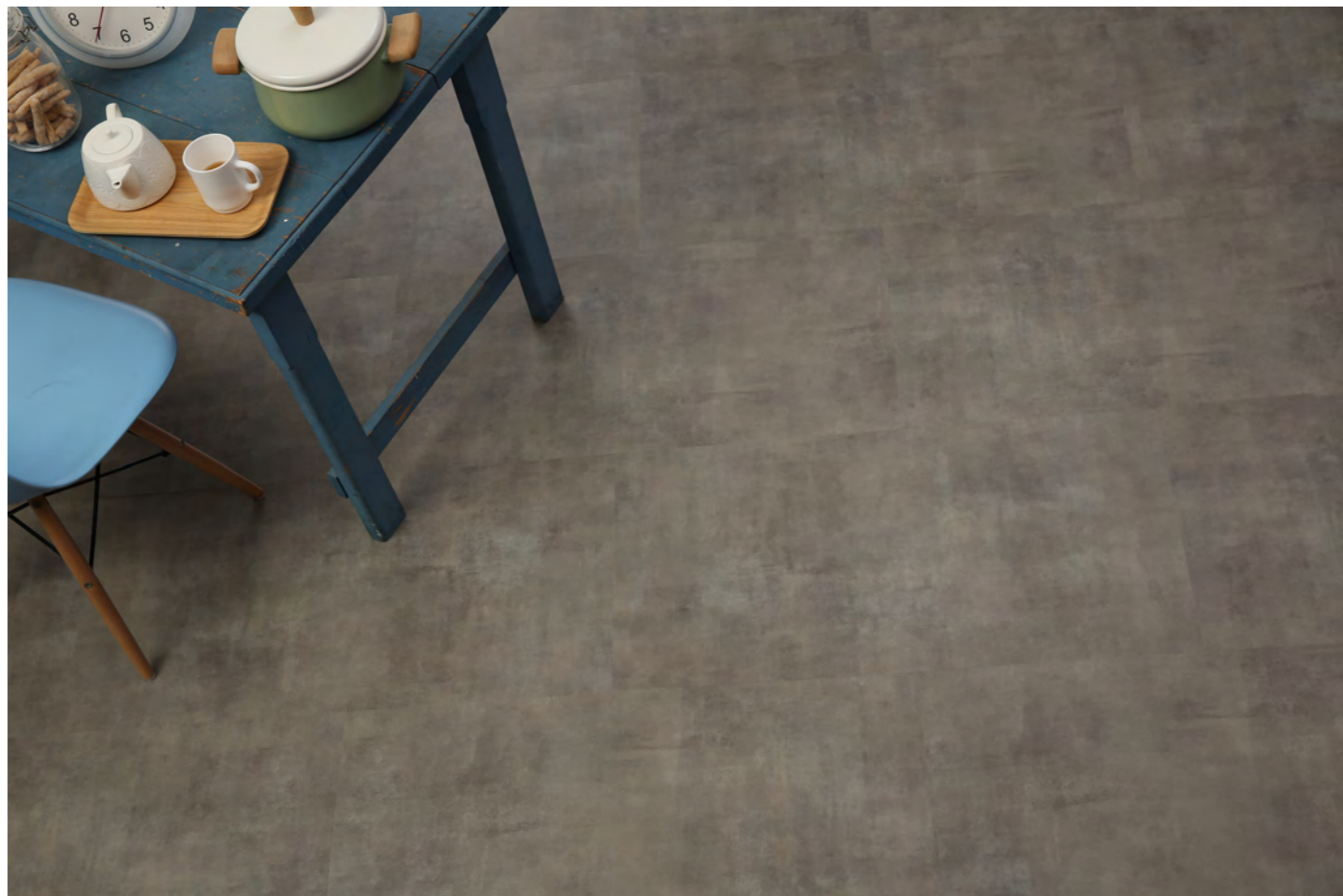
TVS 815 - Cement Light Gray