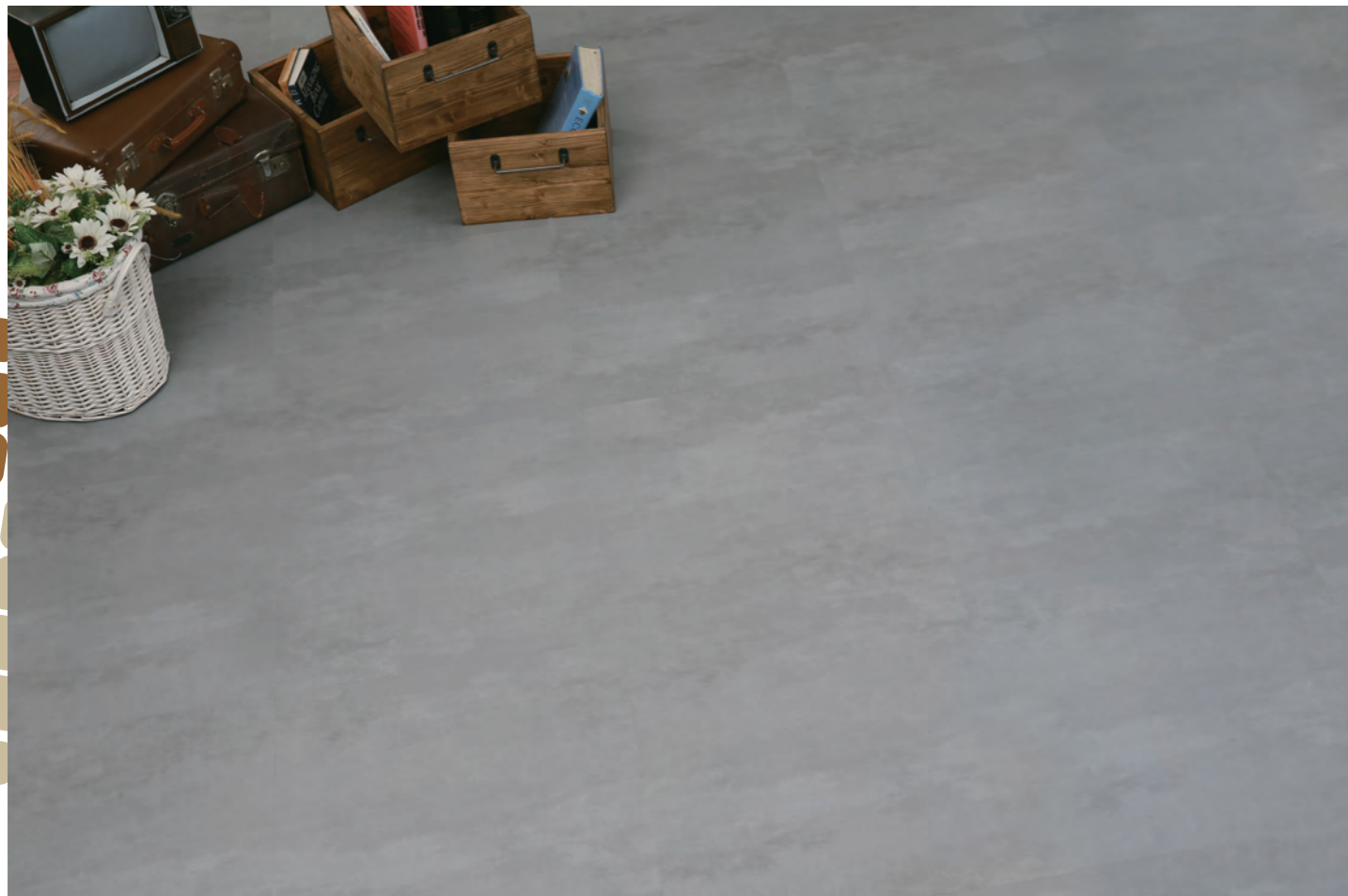
TVS 809 - Indium Smooth