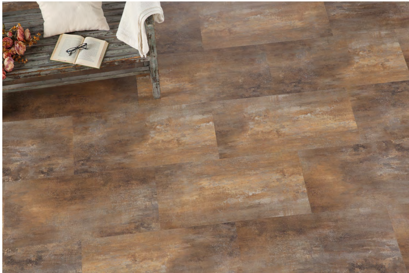
TVS 804 - Rust