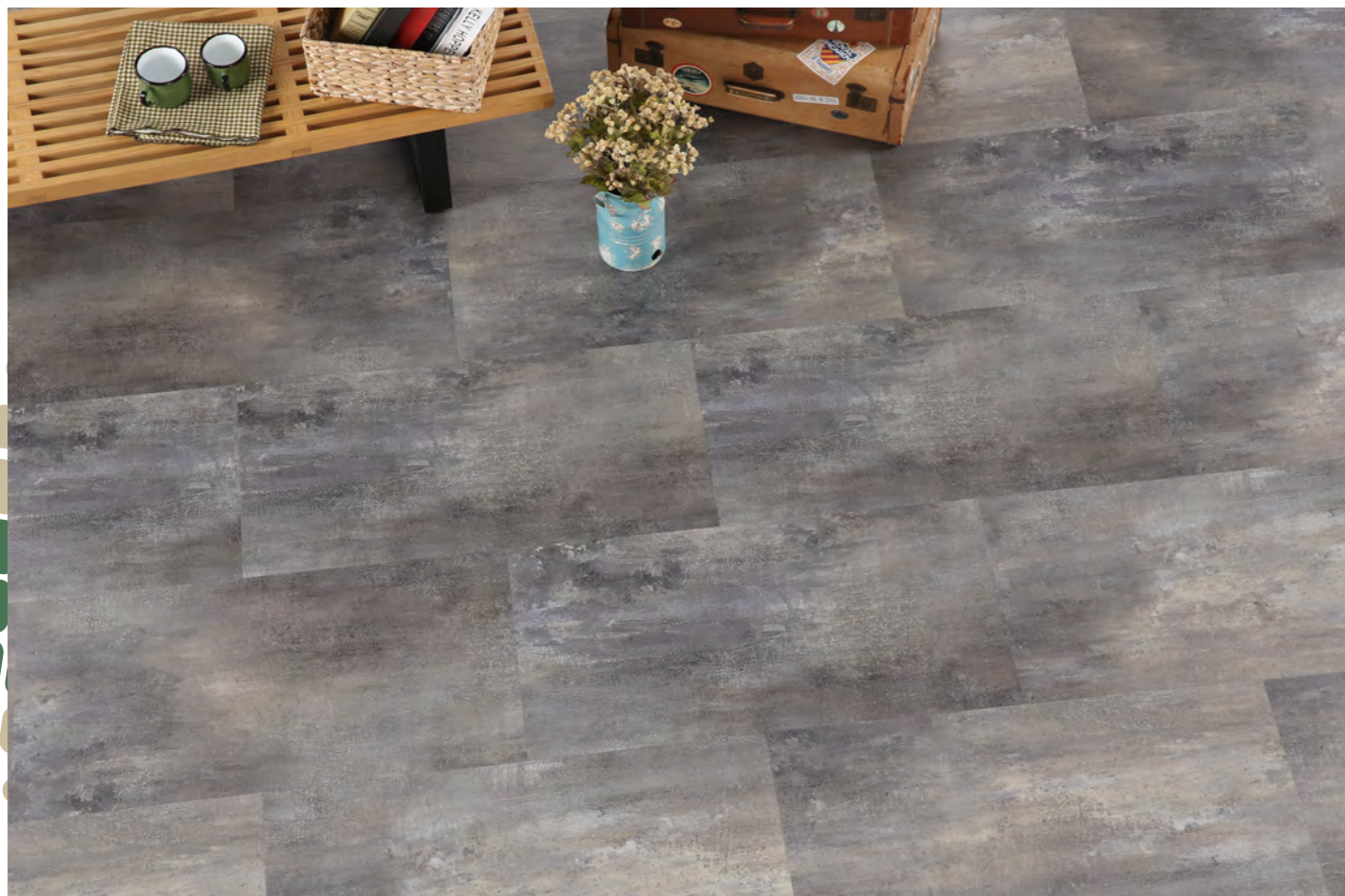
TVS 805 - Graphite