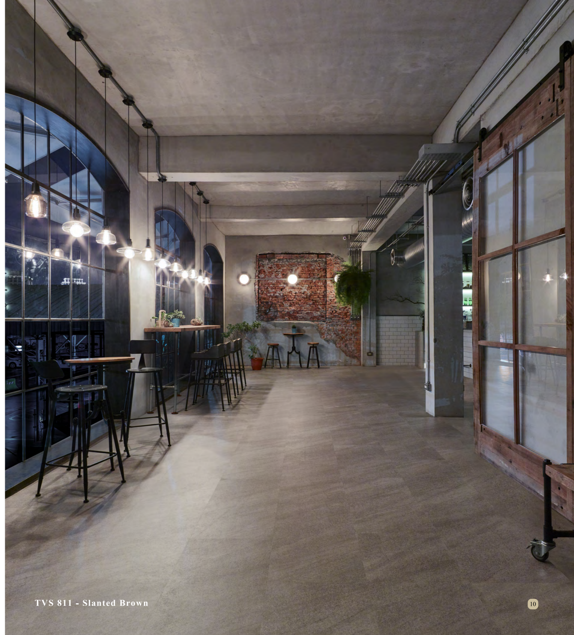
TVS 811 - Slanted Brown