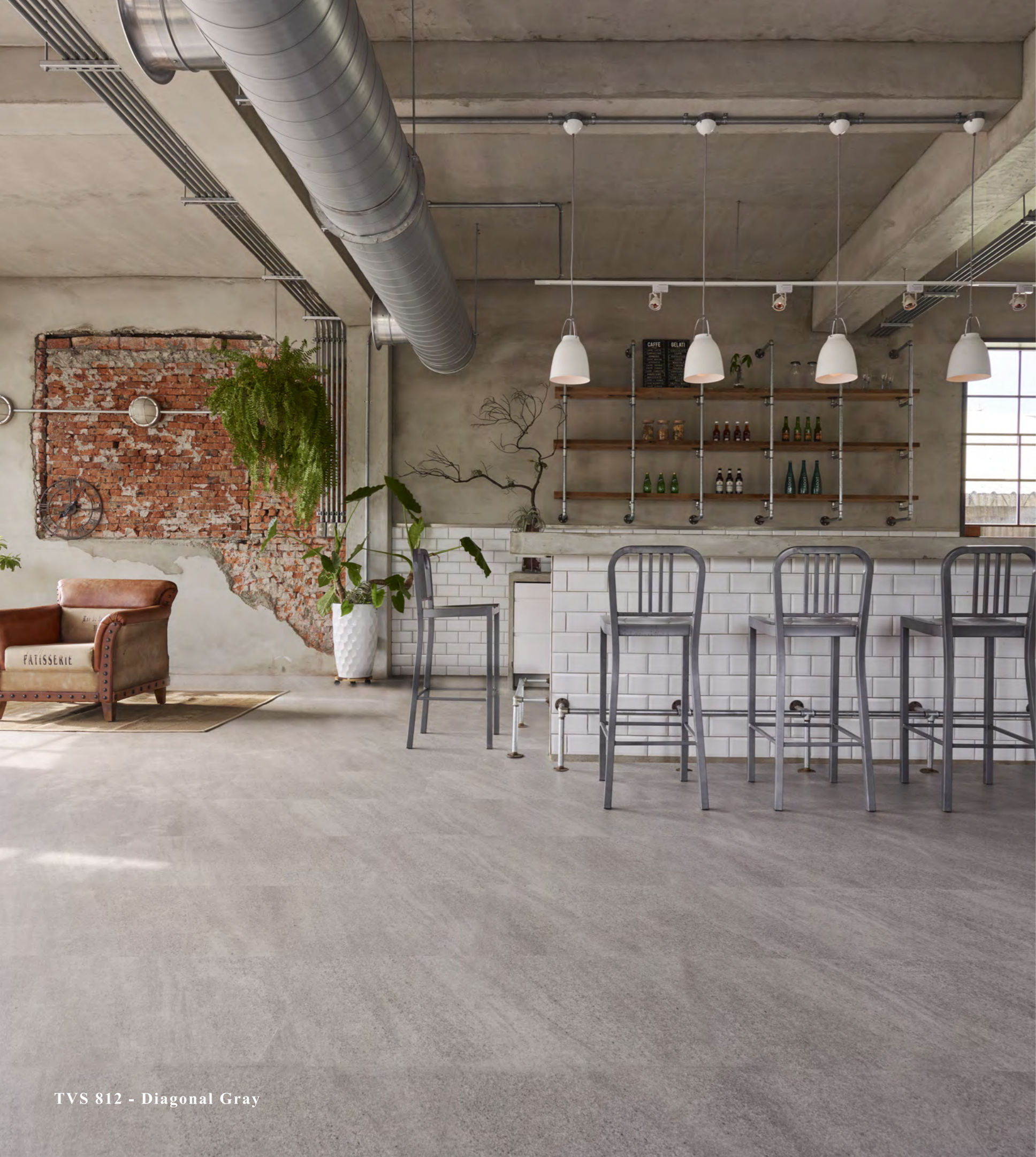
TVS 812 - Diagonal Gray