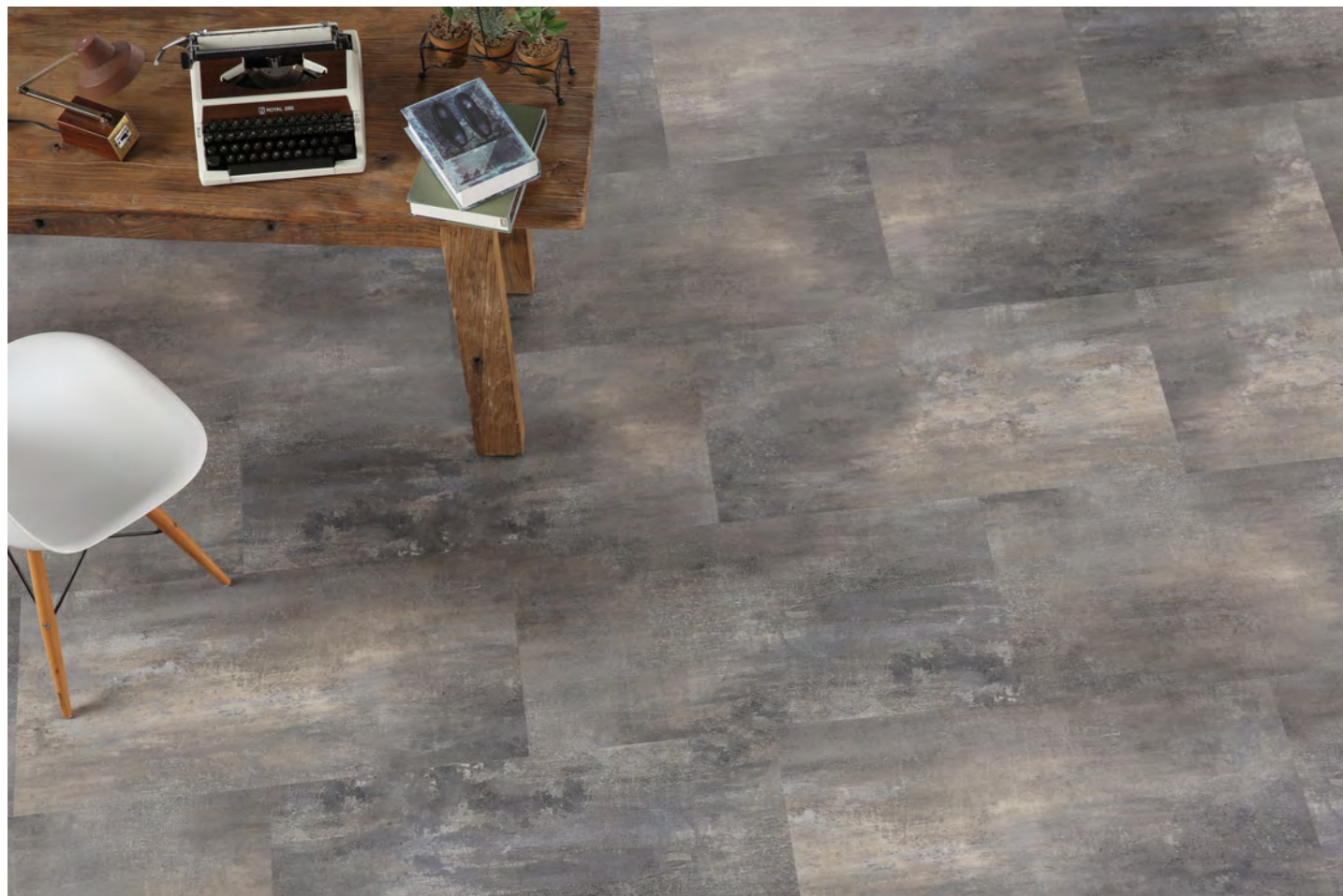
TVS 803 - Indium