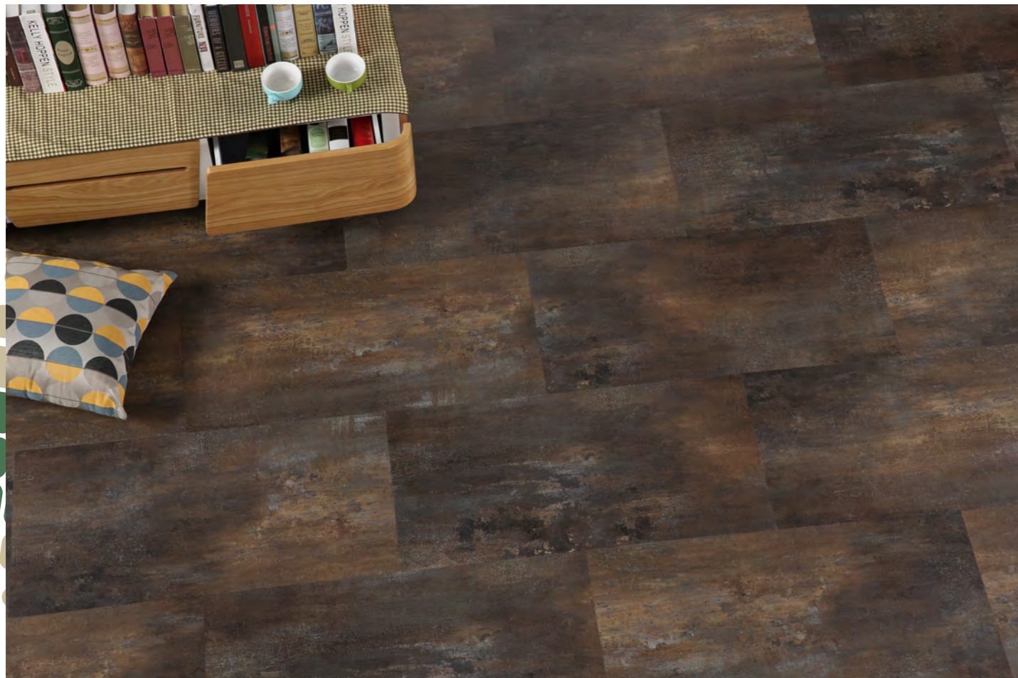
TVS 806 - Stardust